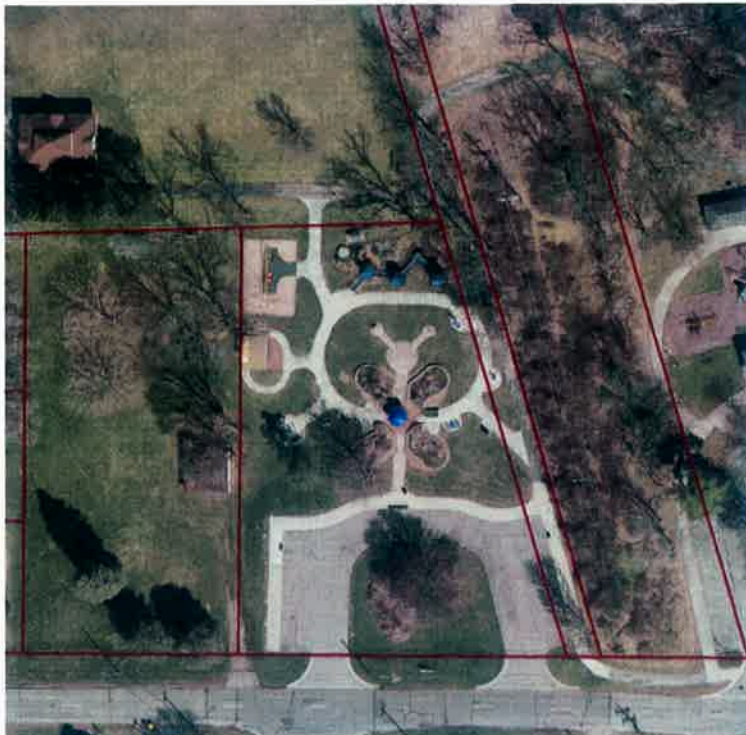
All Kids Playground Park