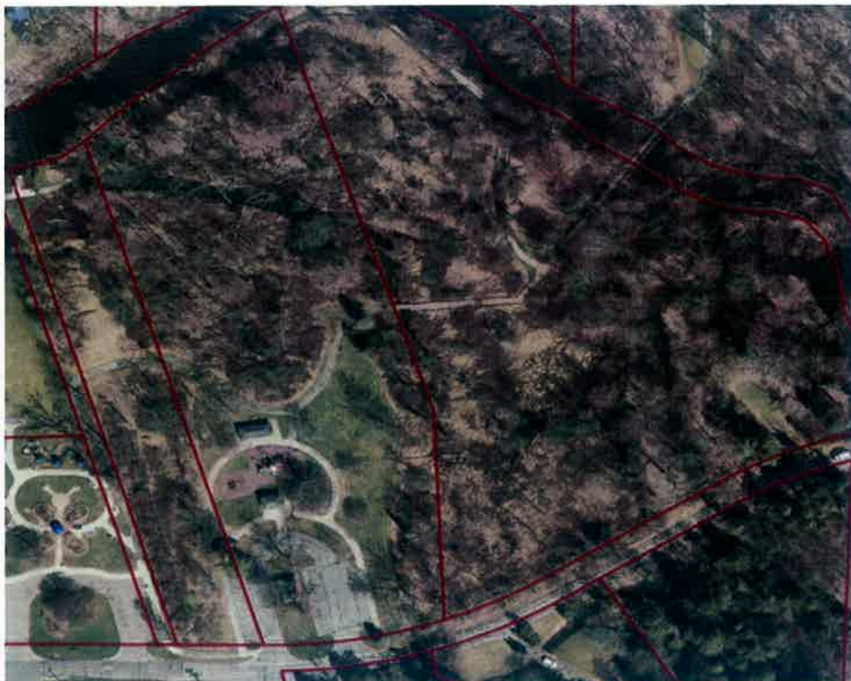
River Trial Park