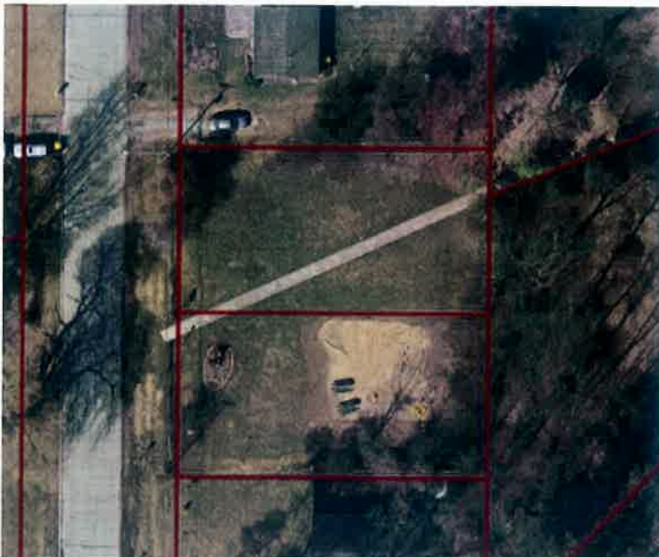
Percy Carris Park